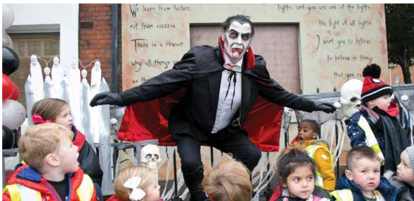
DRACULA WITH LOCAL CHILDREN AT BIG SCREAM LAUNCH