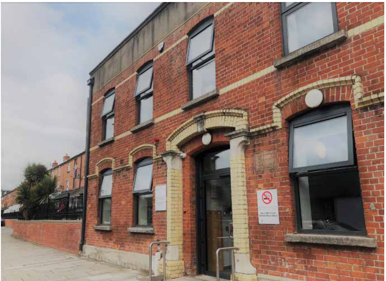
NEW SOCIAL INCLUSION HUB AT SUMMERHILL

The healthlink team is a collaborative, multi-disciplinary initiative to address the needs of people who are homeless and in emergency accommodation.