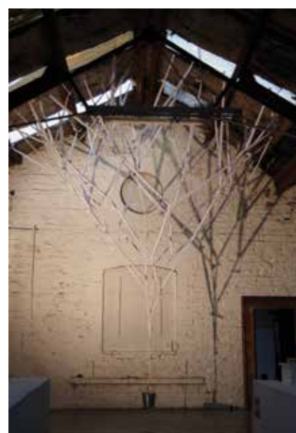
CLAIRE MCCLUSKEY WORKSHOP