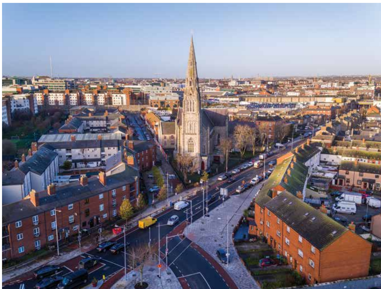
ST. LAURENCE O'TOOLE CHURCH ON SHERIFF ST