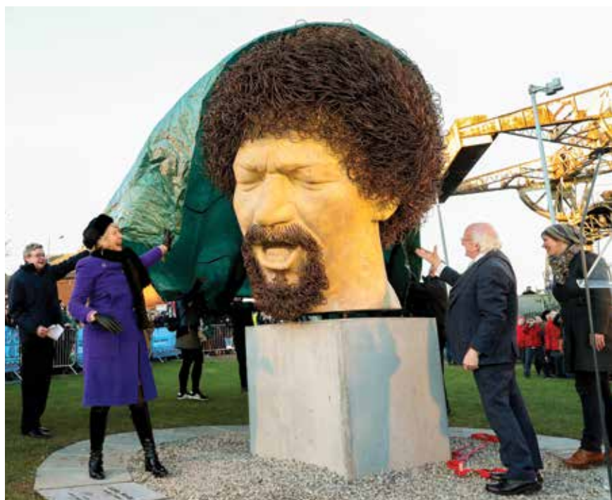
PRESIDENT MICHAEL D. HIGGINS UNVEILS LUKE KELLY STATUE