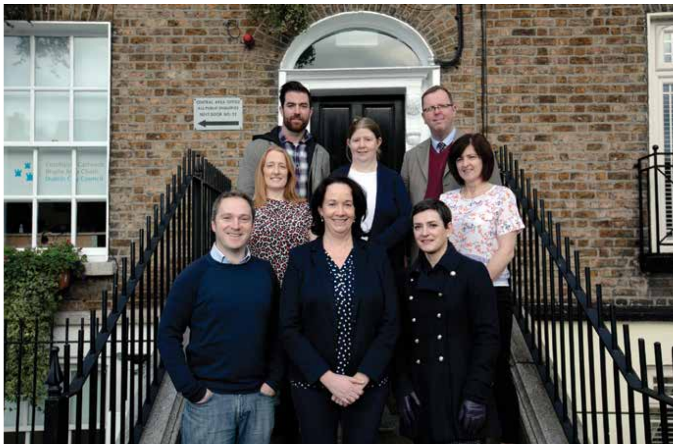
MEMBERS OF THE NEIC PROGRAMME OFFICE.

The Programme Office supports the work of the Board and is based at 51-53 Sean McDermott Street Lower, Dublin 1.