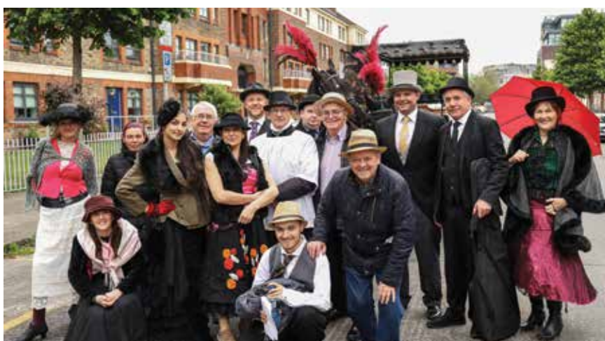
BLOOMSDAY IN THE MONTO