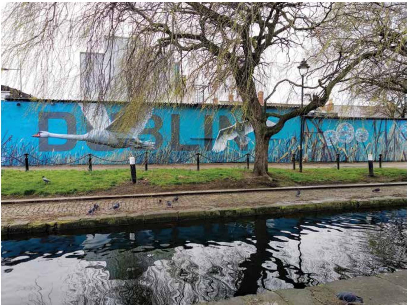
NEW MURAL AT ROYAL CANAL BANK BY SHANE SUTTON