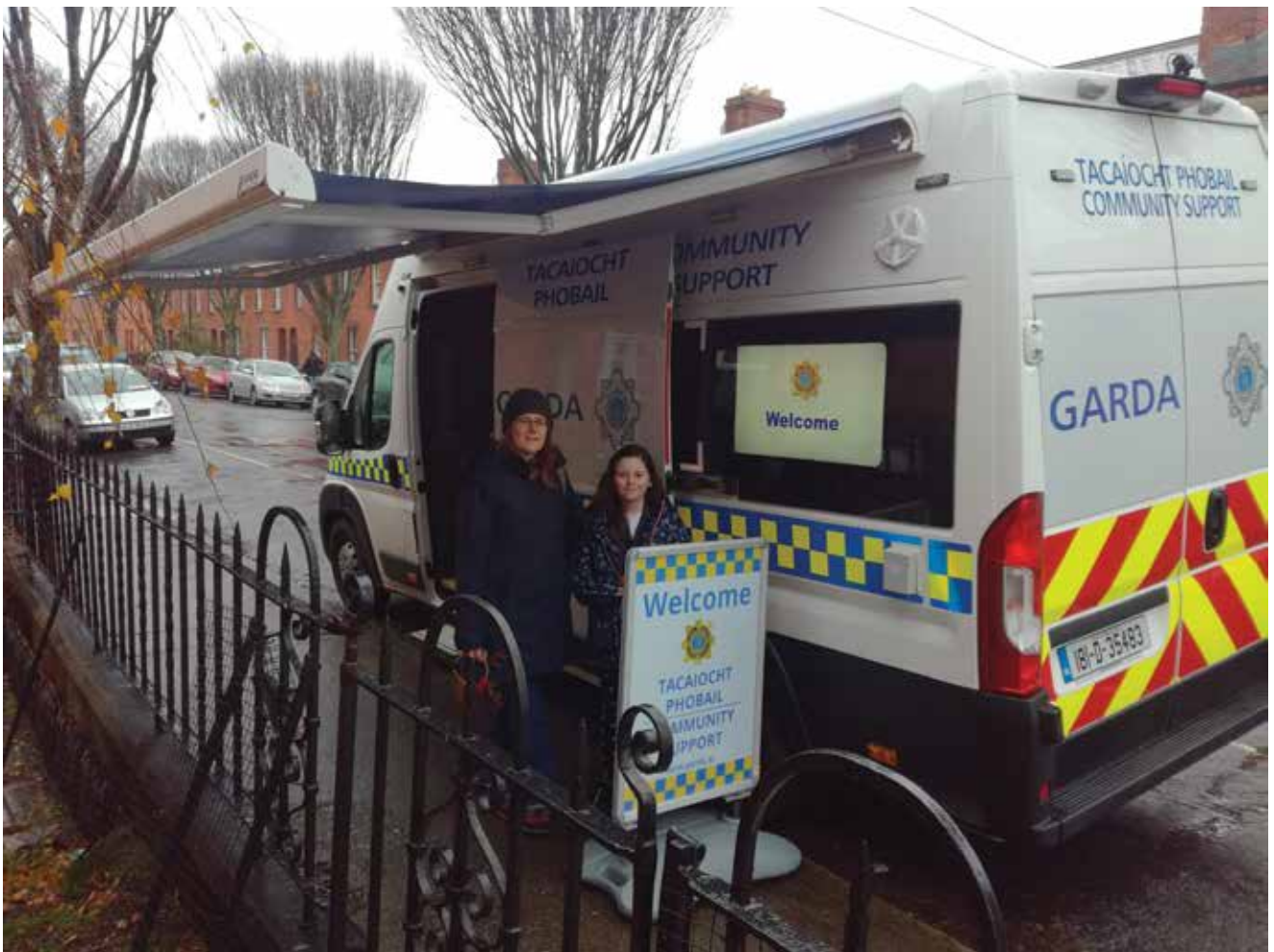
GARDA COMMUNITY SUPPORT VEHICLE