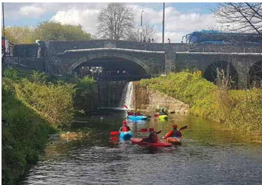
MEMBERS OF THE ADVENTURE PROJECT ENJOYING THE LOCAL ROYAL CANAL AMENITY