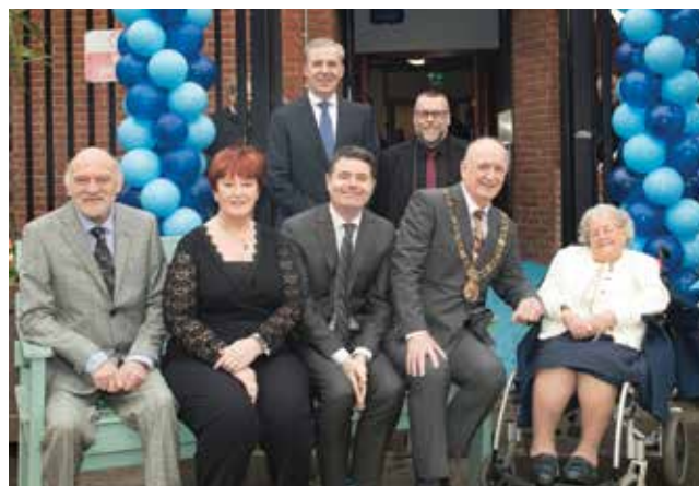
OFFICIAL OPENING OF LOURDES DAYCARE EXTENSION