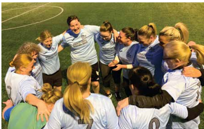
GAA FOR MAS

Weekly training sessions were also provided in 2019 to a number of extra schools including Rutland NS, Central Model Schools, St. Vincent's Boys School and Scoil Chaomhin. The