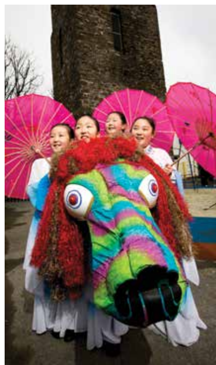
LAUNCH OF HILL ST. CHINESE NEW YEAR