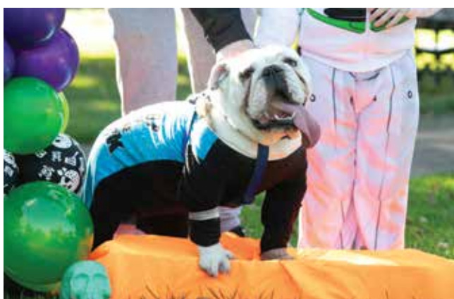
THE BIG SCREAM DOGGIE DRESS UP EVENT, MOUNTJOY SQ