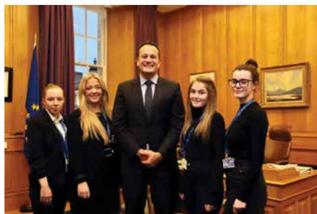
NEIC TY STUDENTS IN THE DEPARTMENT OF THE TAOISEACH - NOVEMBER 2019

Often, work experience placements can reflect and reproduce patterns of inequality with students from economically disadvantaged areas having significantly less access to the benefits of 'professional placements'. The NEIC Work Experience Placement Programme is a conscious effort to buck this trend and is one strand in a coordinated effort to open doors, raise awareness and aspirations and ultimately to provide students in the NEIC with access to and insight into professions and career paths outside their existing network.