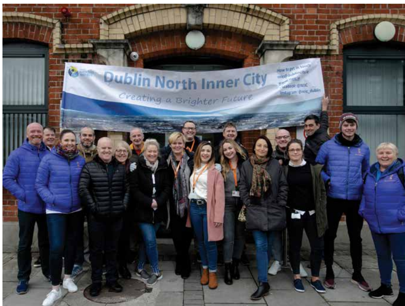
TEAMS FROM ANA LIFFEY, SWAN OUTREACH TEAM AND HSE SOCIAL INCLUSION HUB