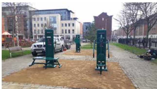
DIAMOND PARK GYM EQUIPMENT BEING INSTALLED MARCH 2019