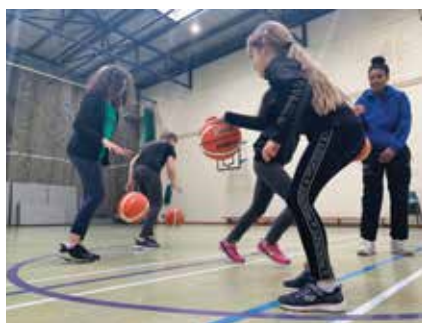
PARTICIPANTS WARMING UP AT THE BASKETBALL ACADEMY ON SATURDAY MORNINGS IN LARKIN COMMUNITY COLLEGE

Basketball for young people continues in Larkin Community College on Saturday mornings and has targeted primary school boys and girls in the area (8 - 12 year olds). Over 40 young people are in regular attendance at these sessions with a youth club basketball league due to commence in 2020.