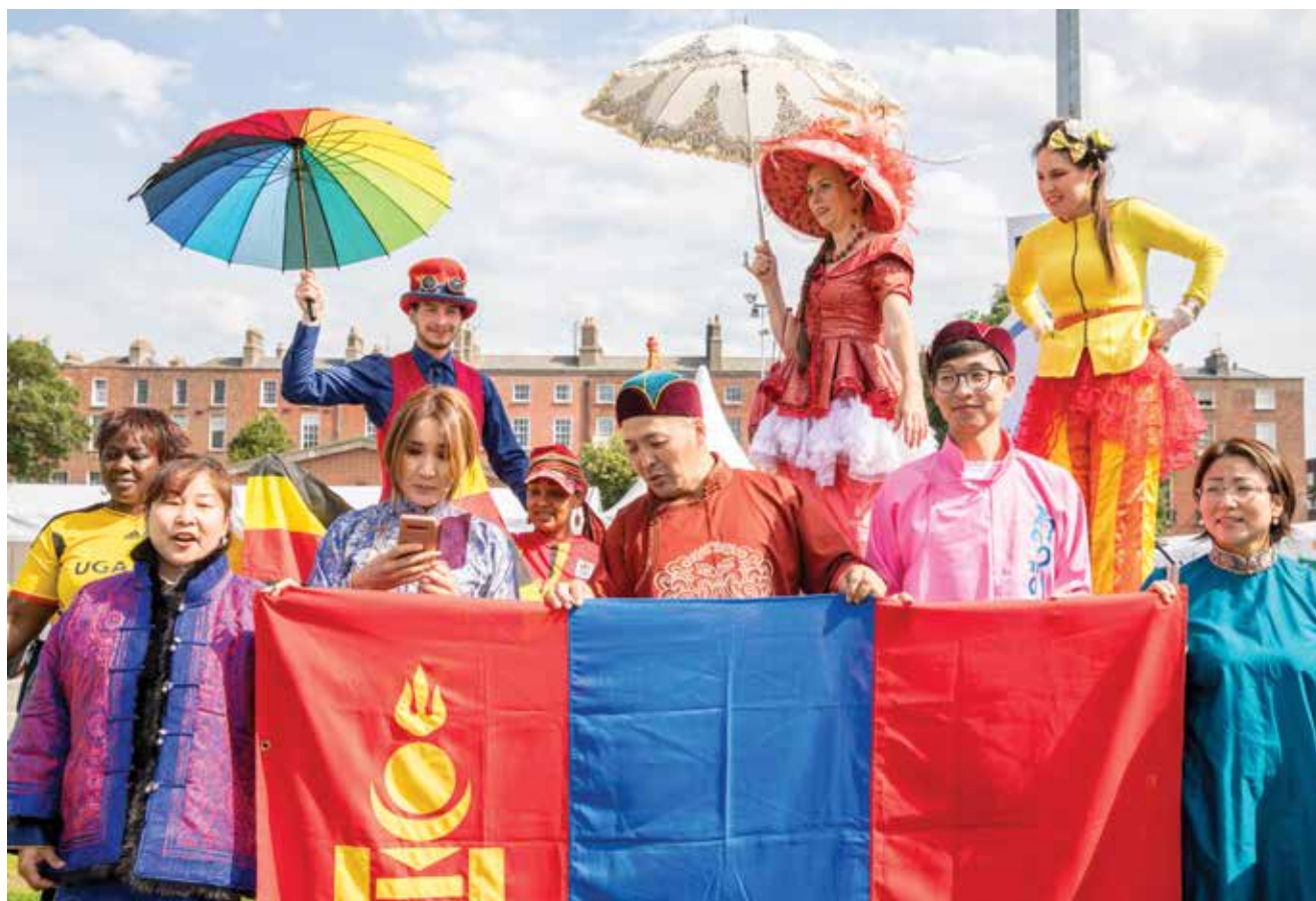
PARTICIPANTS IN FESTIVALS OF NATIONS MOUNTJOY SQUARE PARK