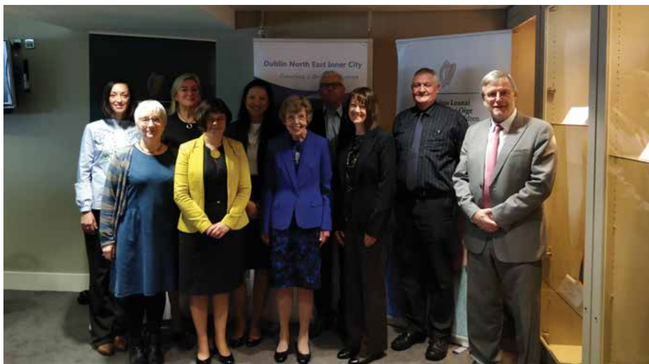
MEMBERS OF BOSTON COLLEGE CITY CONNECTS VISITING DUBLIN

DCYA and DES have ongoing engagement with Boston College as they prepare for implementation in 2020. The planning phase will continue into early 2020 identifying resourcing needs of schools, roles and responsibilities, the pattern of partnering between schools and services and where gaps lie in service provision in the area.