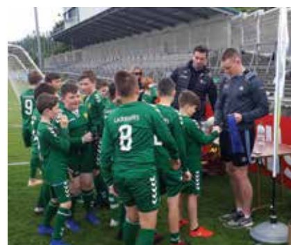
PRIMARY SCHOOL FOOTBALL BLITZ