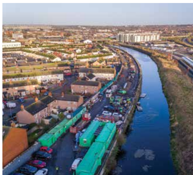
CANAL CYCLE WAY 2019