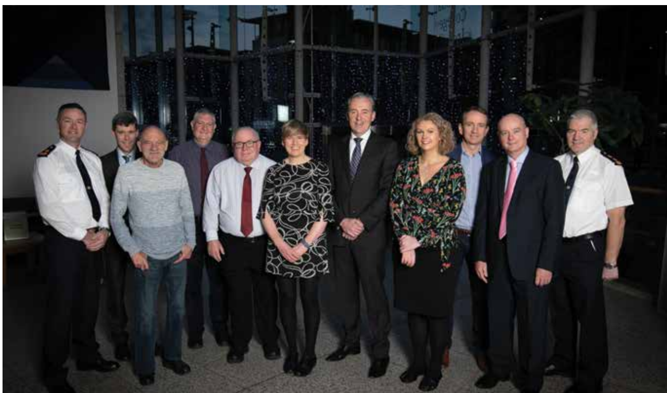
MEMBERS OF THE PROGRAMME IMPLEMENTATION BOARD.