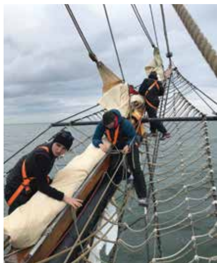
U18 SAIL TRAINING 2019.

This summer 30 people from the North East Inner City took part in the NEIC Sail Training Voyages aboard the tall ship Pelican of London and the Dublin based vessel Brian Boru."