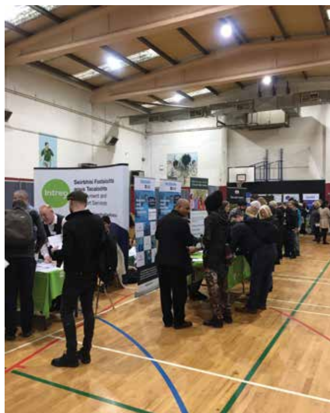
NEIC JOBS FAIR, OCTOBER 2019