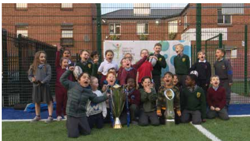
NORTH WALL LIONS - LAURENCE O TOOLE RECREATION CENTRE