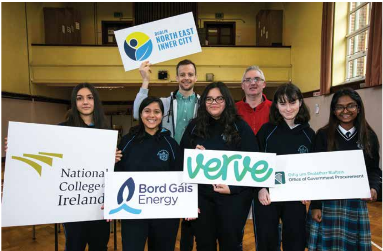
STUDENTS WHO TOOK PART IN THE NEIC TRANSITION YEARS WORK PLACEMENT PROGRAMME