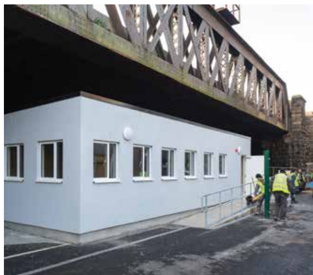
NEW UNIT FOR BALLYBOUGH U10S PROJECT

The positioning of this unit also represents an innovative use of a railway arch and will serve as an example of the potential for practical uses of other such spaces throughout the north east inner city. Discussions are ongoing with Iarnród Éireann in this regard."