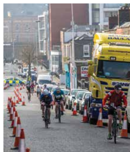
TRY A TRI 7TH APRIL BUCKINGHAM ST.