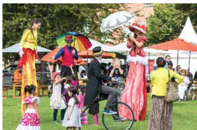
FESTIVAL FUN AT THE FESTIVAL OF NATIONS, MOUNTJOY SQ