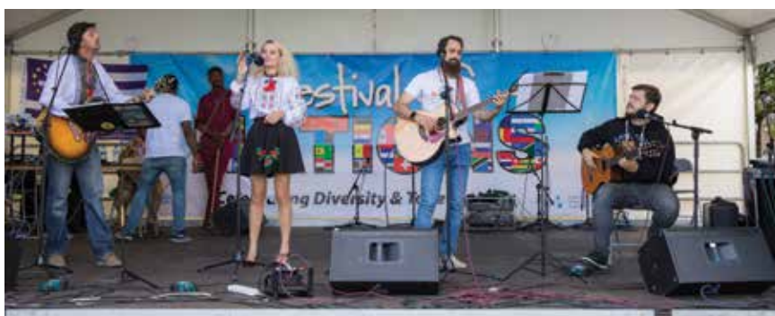
FIREFLIES - ROMANIAN FOLK SONGS AT FESTIVAL OF NATIONS