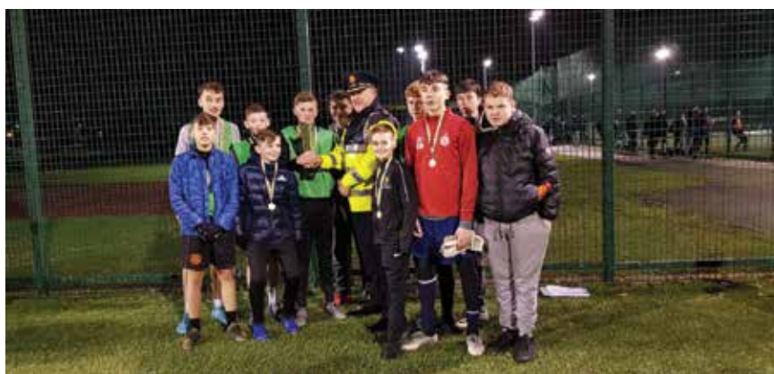
NOEL O'REILLY LEAGUE

The Noel O'Reilly Leagues for Youth Services / Groups continued through 2019 with support from the North East Inner City Initiative. The League provides regular football activity for young people (10-12 years and 13-15 years) in the North East Inner City. Swan Youth Services, Belvedere Youth Club, East Wall Youth Service, Crosscare Ballybough and St. Laurence O' Toole Recreation Centre all took part in the league. A number of other programmes including a girl's community camp, late night leagues, school programmes, and football for all were delivered across the area in 2019.