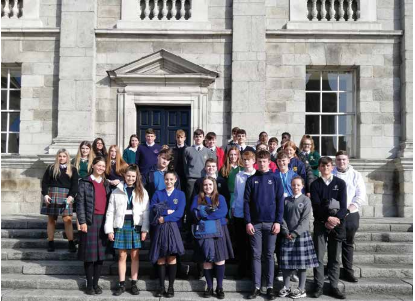
STEP IN EXPERIENCE 2019 - TRANSITION YEAR STUDENTS

Throughout 2019, a number of businesses in the North East Inner City have supported the NEIC initiative and community. For example in the school year 2019/2020, 66 organisations will provide work experience placements for Transition Years students including: