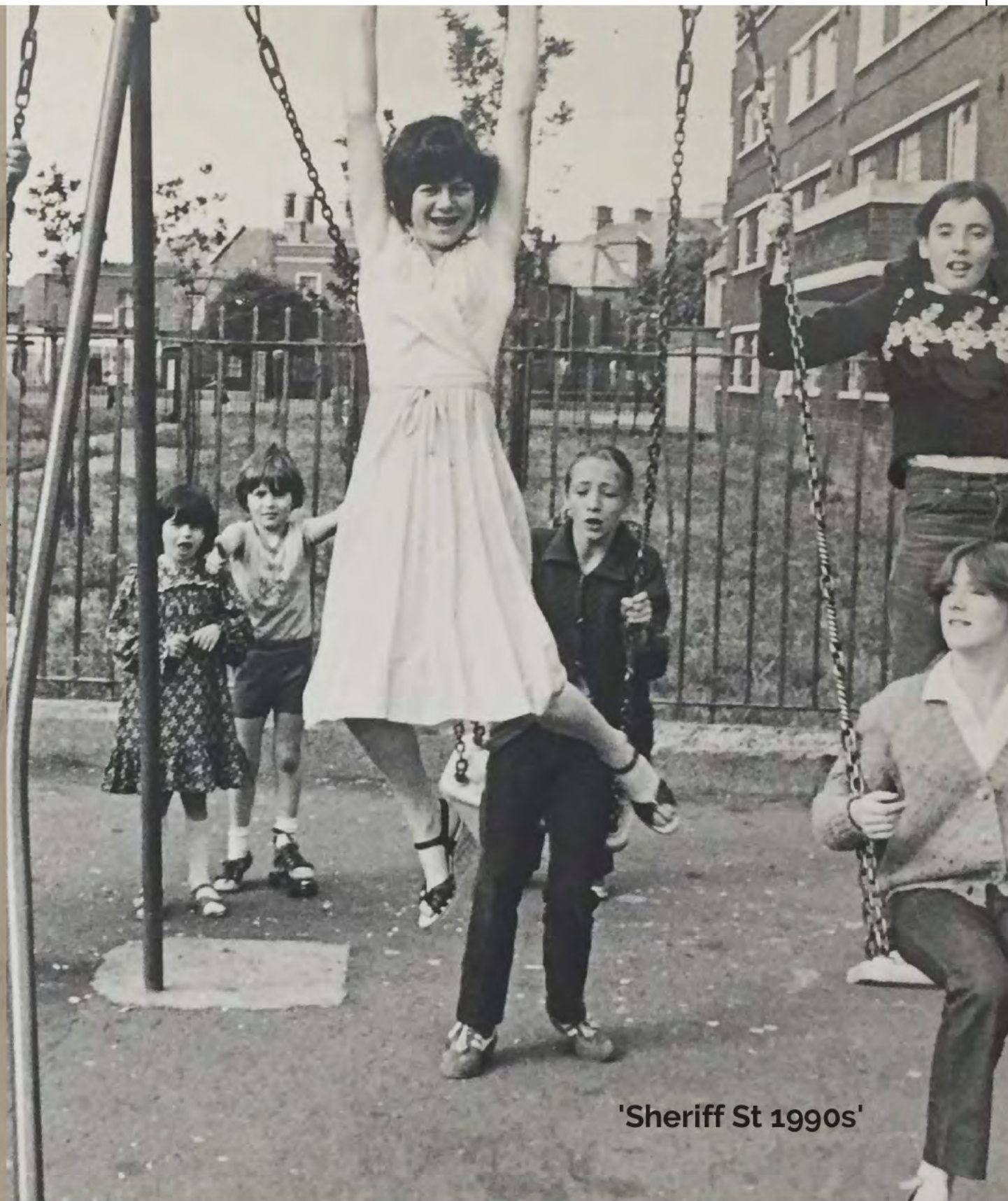
'Sheriff St 1990s'