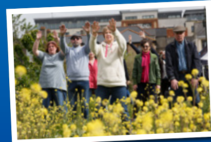
Free Tai Chi class as part of the Community Picnic in Mud Island