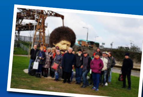
North Wall - walking tour