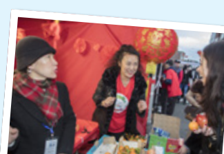
Chinese New Year fruit