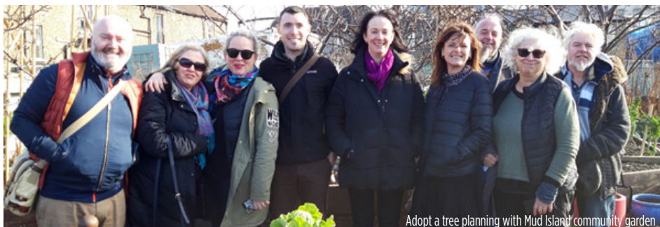
Adopt a tree planning with Mud Island community garden

The next phase of the NEIC Greening Strategy will see a number of exciting projects that will include community and volunteer groups and local residents, which means you!!! They have been designed to promote greening opportunities in selected areas; e.g. green walls and biodiversity gardens. The North East Inner City Greening Strategy team will provide expertise, guidance and resources to give people the opportunity to carry out their own fun greening projects.