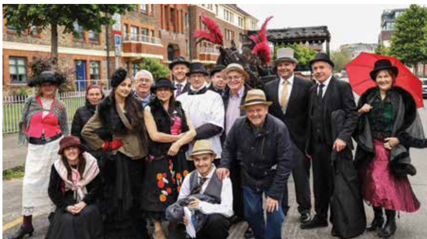
BLOOMSDAY IN THE MONTO