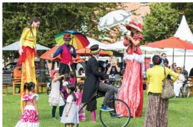
FESTIVAL FUN AT THE FESTIVAL OF NATIONS, MOUNTJOY SQ