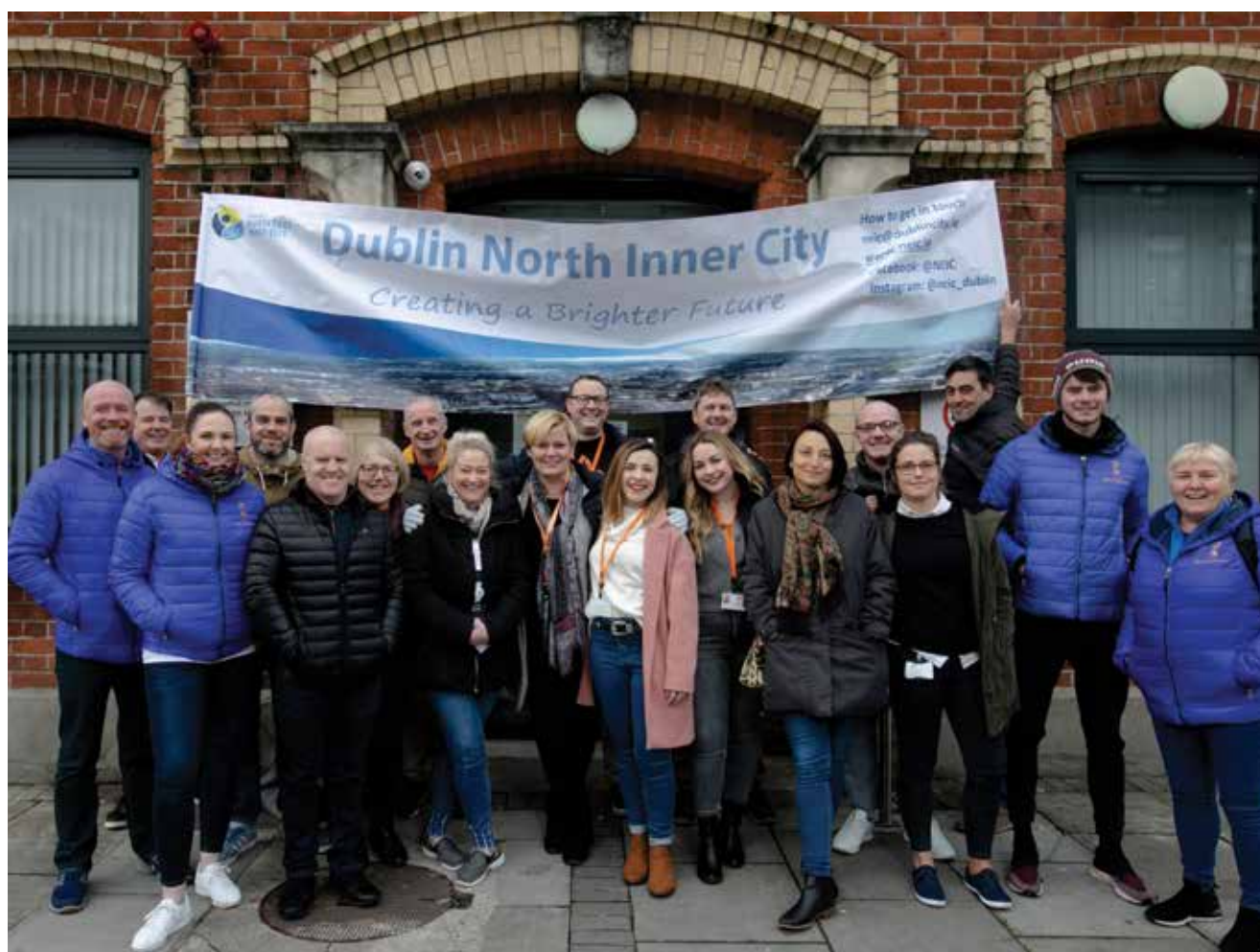
TEAMS FROM ANA LIFFEY, SWAN OUTREACH TEAM AND HSE SOCIAL INCLUSION HUB