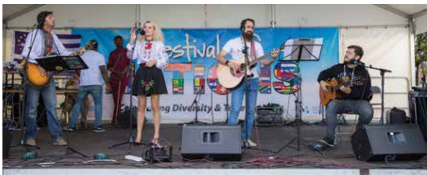
FIREFLIES - ROMANIAN FOLK SONGS AT FESTIVAL OF NATIONS