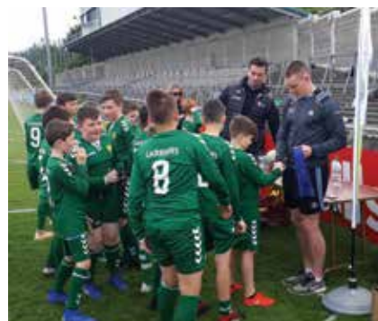
PRIMARY SCHOOL FOOTBALL BLITZ