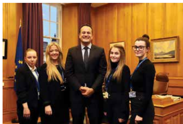
NEIC TY STUDENTS IN THE DEPARTMENT OF THE TAOISEACH - NOVEMBER 2019

Often, work experience placements can reflect and reproduce patterns of inequality with students from economically disadvantaged areas having significantly less access to the benefits of 'professional placements'. The NEIC Work Experience Placement Programme is a conscious effort to buck this trend and is one strand in a coordinated effort to open doors, raise awareness and aspirations and ultimately to provide students in the NEIC with access to and insight into professions and career paths outside their existing network.